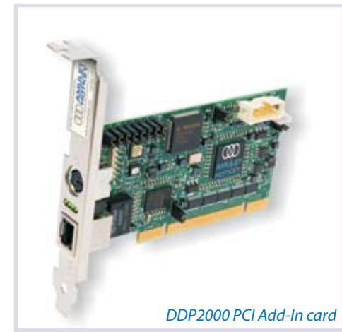
DDP2000 PCI Add-In card

Amulet Hotkey Ltd. Suites 27-29 The Hop Exchange 24 Southwark Street London SE1 1TY